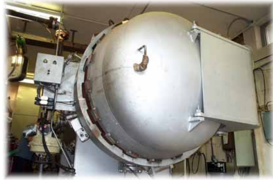
Figure 1. Pressure Vessel

Baseline tests were conducted to establish a comparison benchmark. These baseline tests were conducted by letting the simulated aerosol can explode without the presence of a suppression agent. The results showed