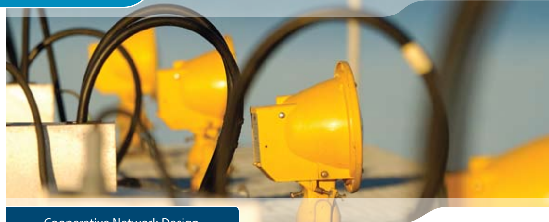
Cooperative Network Design