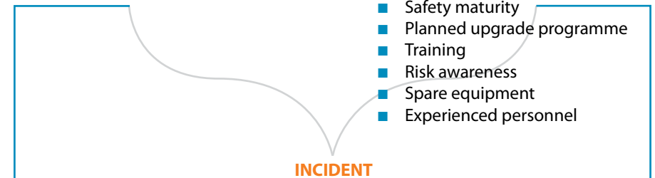
The Incident Pit