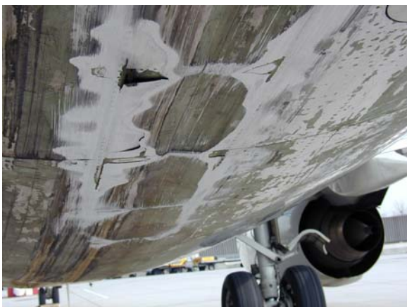
Damage on the lower side of the fuselage

The aircraft was registered by the Turkish civil aviation authority and operated by a Turkish operator.