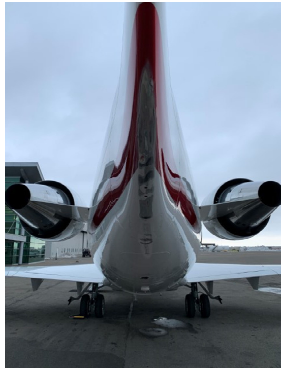
Figure 1. Rear fuselage damage

No damage to other aircraft or property was reported.