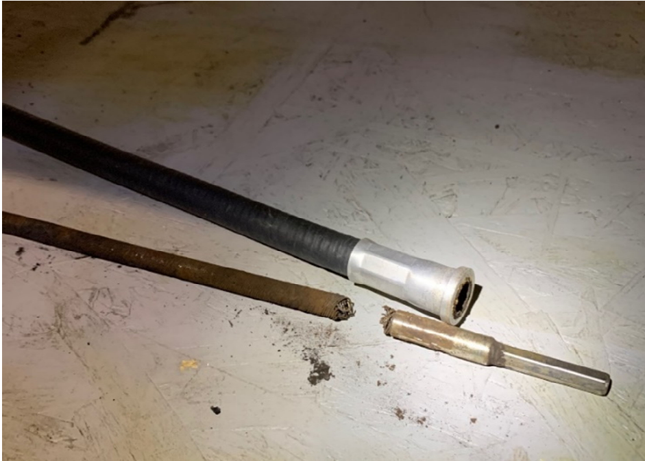
Figure 2. Occurrence aircraft's failed flap flexible drive shaft