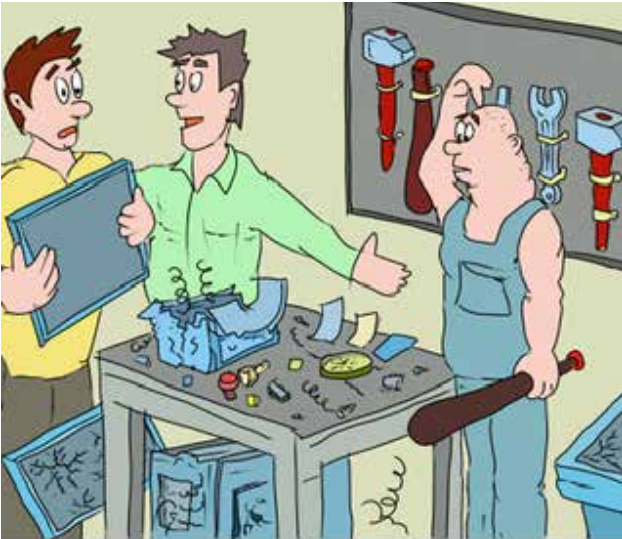
"Let me introduce the new complexity reduction expert!"