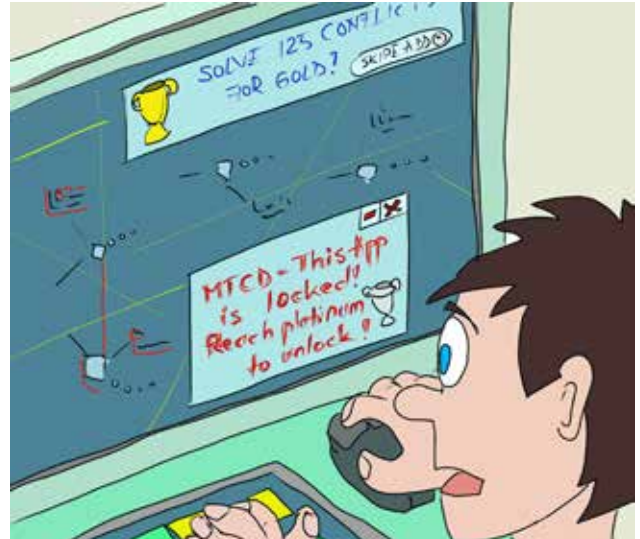
The outsourced software included some surprising features.