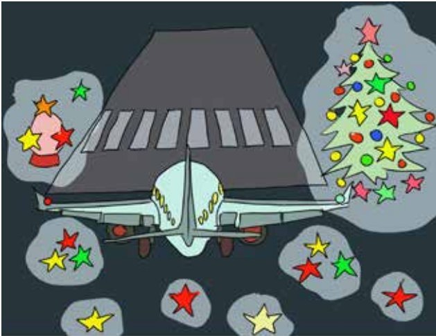
"Sorry BigJet 123! VASIS is out due to energy restrictions. But fortunately we have our neighbours decorations to help you land..."