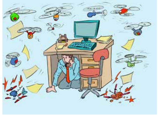
"Security, please find out who left the window open again!"