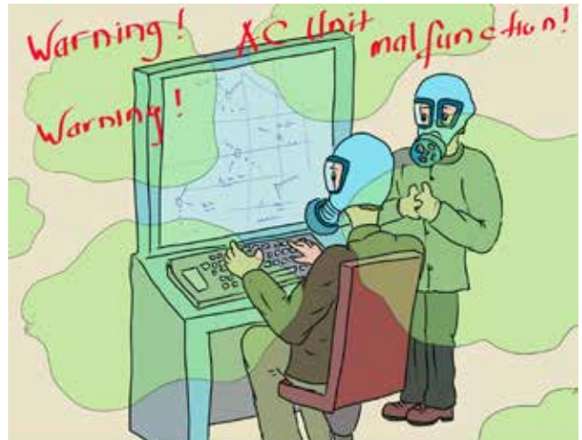
The new pandemic masks came in useful in the end...