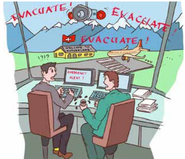
The new tsunami alarm was a surprise to everyone in the Alps...