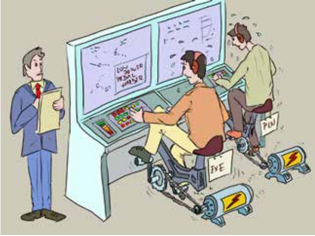
"We now have a solution for the blackout, But we need to adjust sector capacity due to the controllers' physical condition..."