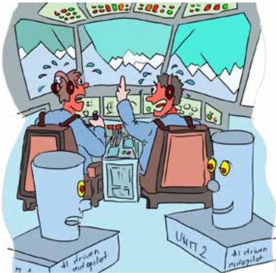
"Should we tell them it's just a high-fidelity simulation?"