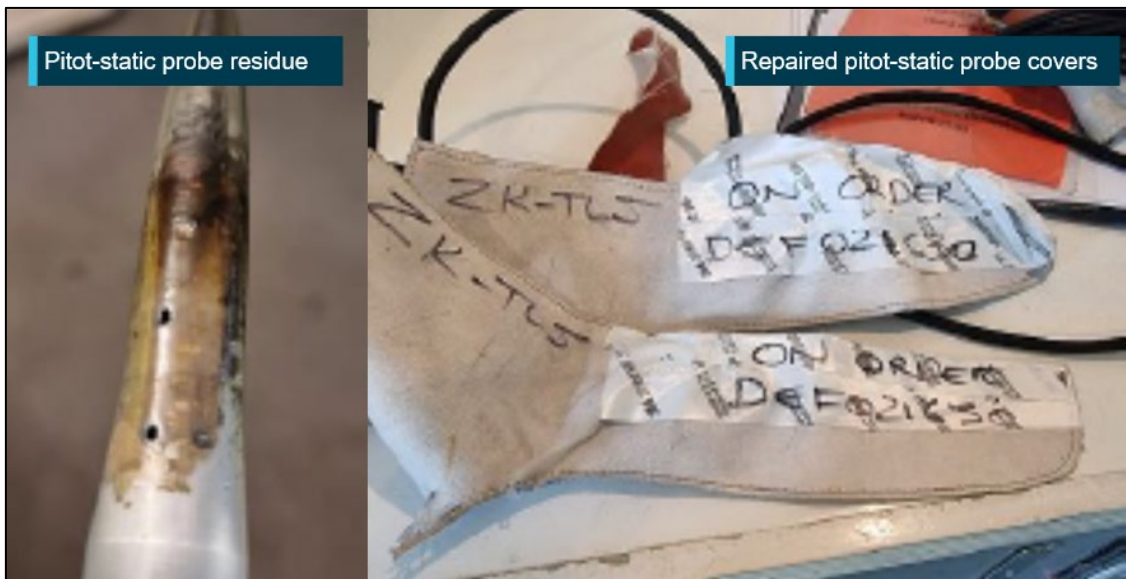
Figure 1: Pitot-static probe and covers

The probes were replaced with serviceable items, the system was tested, assessed serviceable, and the aircraft returned to service. The pitot-static probe covers onboard the aircraft were also inspected and found to have had a temporary repair applied to them (Figure 1).