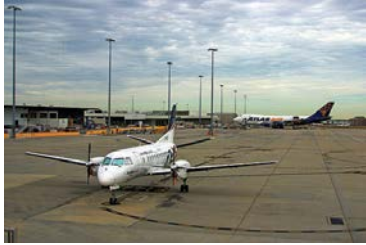
Melbourne Airport.

TAF AMD YMML 292330Z 3000/3106 14008KT 9999 SCT030 FM301100 14003KT 3000 HZ BKN009 PROB40 3017/3023 0400 FG RMK T 14 15 17 14 Q 1016 1014 1013 1014 TAF3