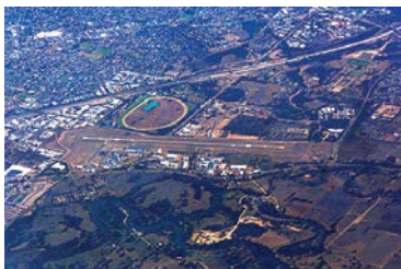
Aerial view of Albury Airport.

TAF YMAY 022230Z 0300/0312 35010KT CAVOK FM030800 31018KT 9999 SHRA BKN025 OVC100 INTER 0308/0312 31020G40KT 3000 +TSRA BKN010 SCT040CB RMK FM030600 MOD TURB BLW 5000FT T 23 24 28 33 Q 1012 1013 1014 1009