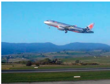
Launceston Airport.