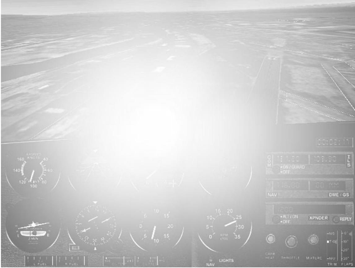
Figure 4: Low-level laser illumination viewed through an aircraft windshield.

children or irresponsible individuals, Class II laser pointers (rather than Class IIIA) are recommended for use by the general public. An increase in the perceived brightness of red laser pointers can be achieved without the need for additional power by selecting those that emit light of wavelengths shorter than 670 nm. While Class IIIA laser pointers can continue to be used by responsible adults, they should be replaced by lower powered pointers whenever possible. Finally, to minimize the threat to aviation safety, pilots should be educated on the dangers of in-flight laser illumination and how to best compensate for its debilitating effects. Although the FAA has established guidelines to protect flight crewmembers from laser illumination during terminal operations, additional regulations may be necessary to defend against the careless or malicious misuse of these devices.