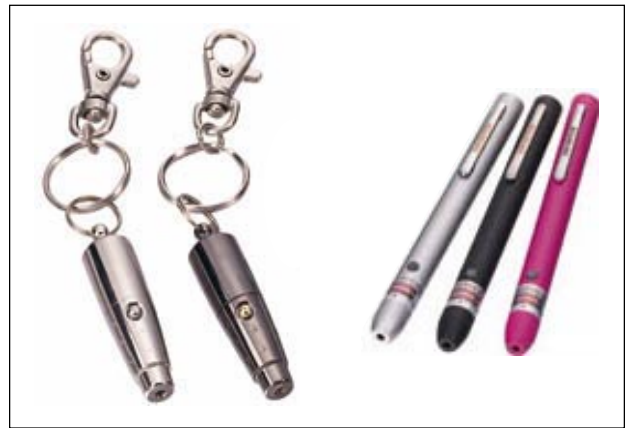
Figure 1: Commercially available laser pointers come in different styles.

There have been other disturbing reports involving the misuse of laser pointers (3,4). Some of these include: arrests made by police after a red beam was interpreted to be that of a laser-sighted weapon, spectators aiming laser pointers at athletes during sporting events, the illumination of drivers on highways, and numerous incidents involving the illumination of fixed-wing aircraft, and law enforcement and medical evacuation helicopters. The visible range of a laser pointer can vary considerably depending on its wavelength, output power, and environmental factors such as background illumination and air quality. The misuse of laser pointers involving exposure distances greater than 10 feet is not likely to cause permanent eye injury. However, at very close range, the light energy that laser pointers can deliver into the eye may be more damaging than staring directly into the sun. This is due to the refractive properties of the cornea and crystalline lens, which increases irradiance ( W/cm^2 ) to the retina by 10^5 . An irradiance of 1 W/cm^2 at the cornea would have an irradiance of 10 kW/cm^2 at the retina (5).