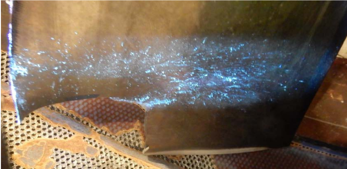
Figure 2: Ultraviolet light showing bird remains on damaged fan blade