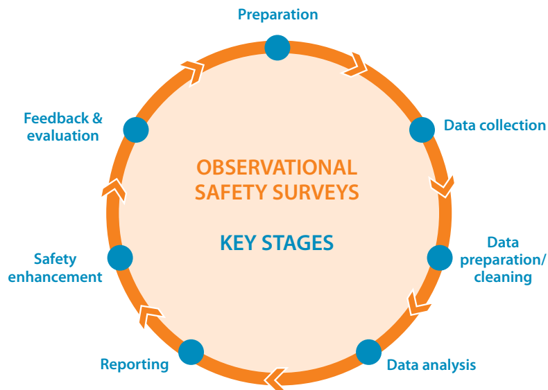
Figure 2: Key stages of observational safety surveys