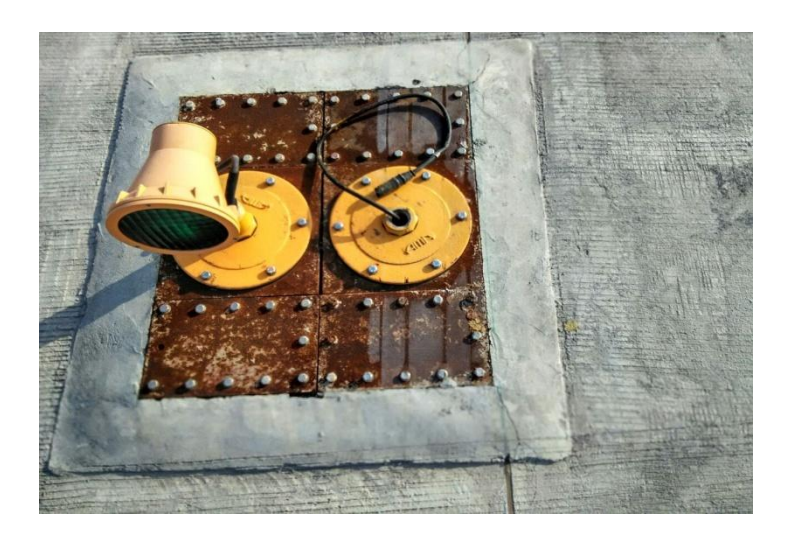
Figure A: Damage to runway lights.

• No tyre markings were reported on the runway.