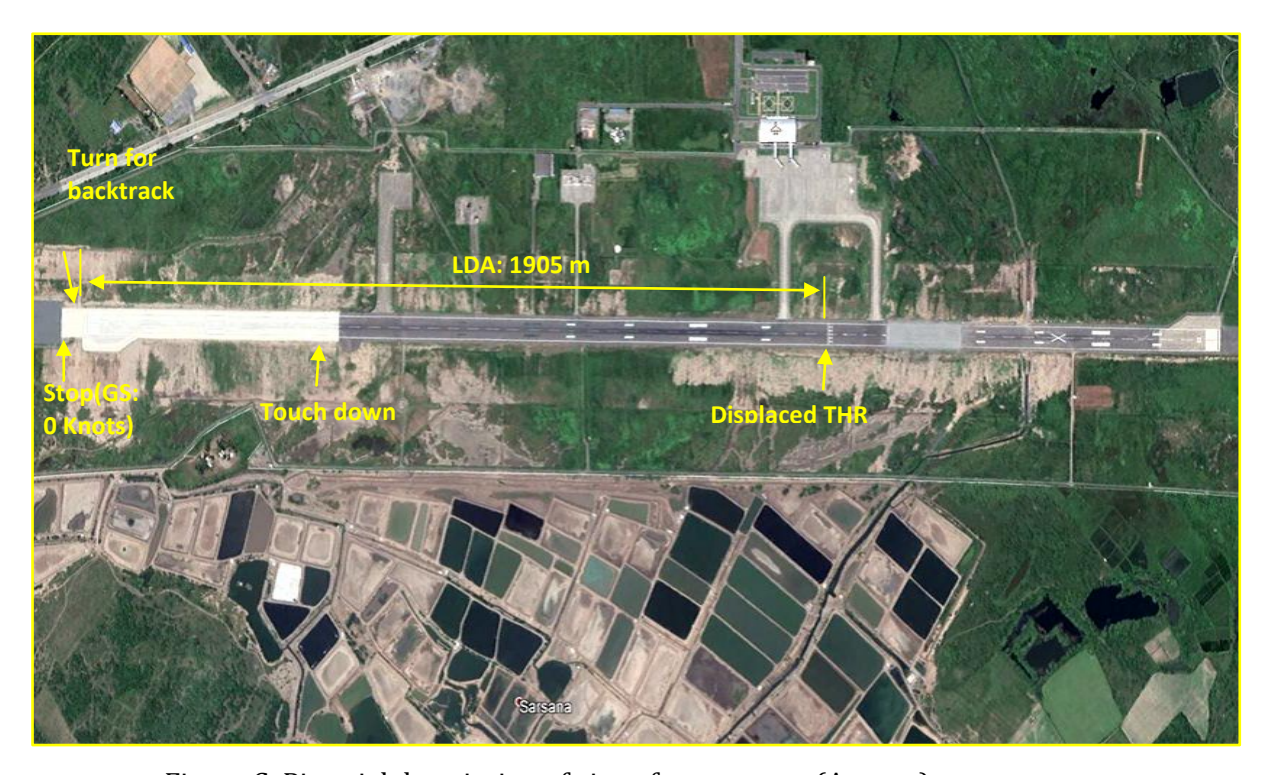
Figure C: Pictorial description of aircraft movement (Approx).

The aircraft being fast and high during the approach was unstablized. Further the aircraft floating on the runway has lead to the aircraft touching down much ahead of the displaced threshold.